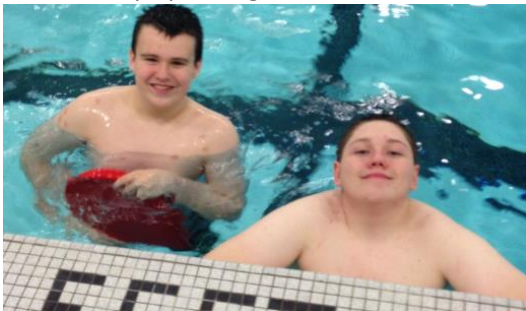
Swimming Pool was open for business