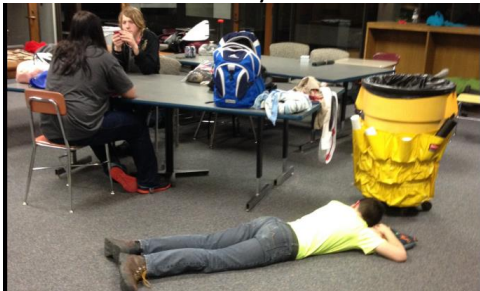
Hard to stay up all night.

Attendees: 26 youth and 11 adults, with 8 of these being walk-ins