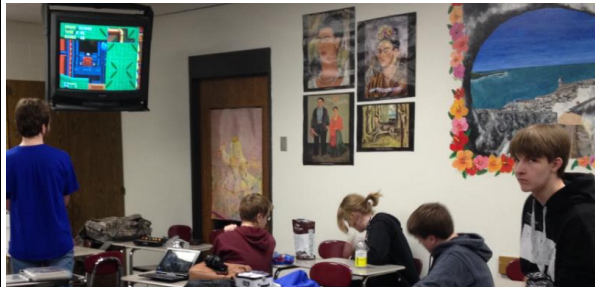
Lots of Video Games