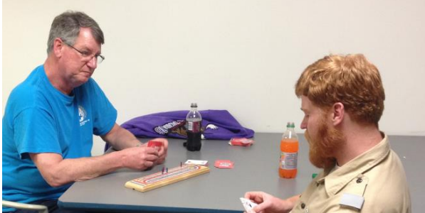
Even the "experienced" Arrowmen found excitement With age comes wisdom