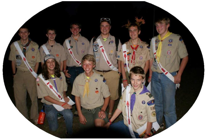
Northern Lights Chapter officers for 2013-2014

With a new lodge year comes a review of our lodge's Tenure Program. Started four years ago, this program rewards those who display selfless service in a chapter or lodge position. This is a YOUTH ONLY award and can be presented to Lodge Officers, Chapter Chiefs and officers, Elangomats, Ceremony Teams, and Troop reps. Lodge and Chapter officers are eligible to earn the silver bordered lodge flap for being elected. Elangomats, ceremony teams, and troop reps have other requirements. For each consecutive year of service in one of those positions you can earn a tenure pin (Moose shaped of course) for your service. Contact your Chapter Chief for more information.